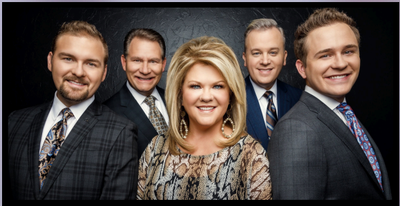
Sunday August 3 - 2 PM Concert- The Whisnants

foremost is the two-volume commentary on the Book of Isaiah in the New International Commentary on the Old Testament series. Exodus: The Way Out (2013) is a recent work. Oswalt adheres to single, unitary authorship of the Book of Isaiah. Numerous scholarly journals, biblical encyclopedias, and academic religious periodicals have included articles by him.